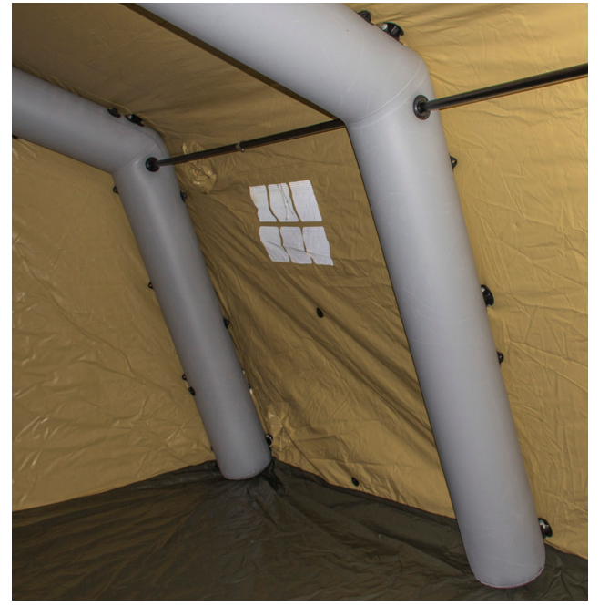
An interior view of the Sentinel II shelter system.

Beds, work stations, tables, seating and food prep