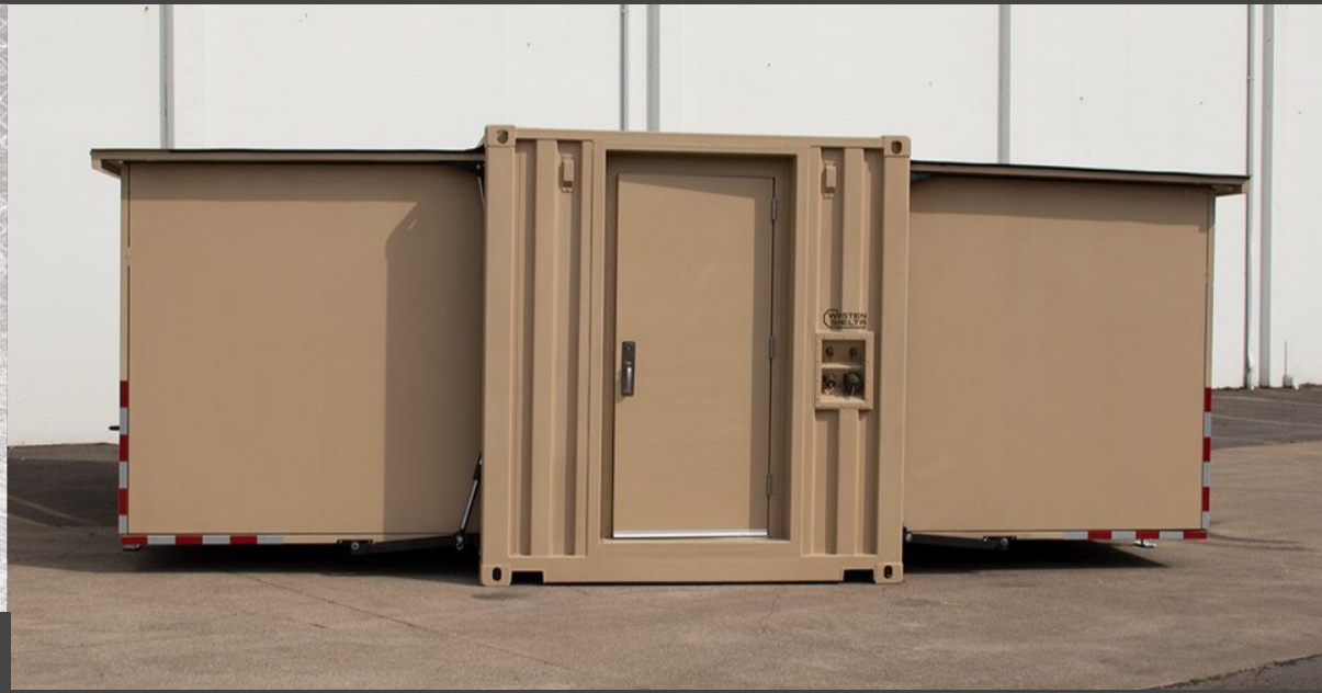
MECS II MOBILE EXPANDABLE CONTAINER SYSTEM